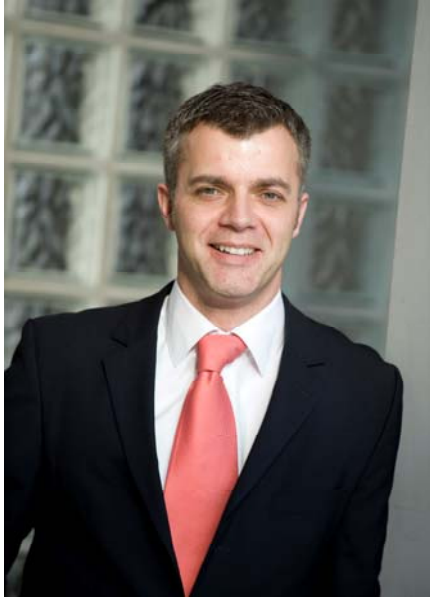
CFO 1&1 Internet AG